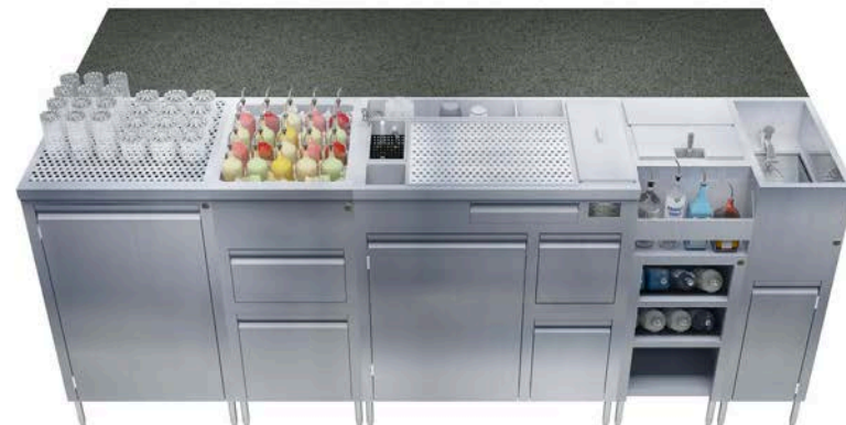
EuroBar | Alto ™