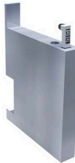
RETRACTABLE SODA GUN PATENT PENDING