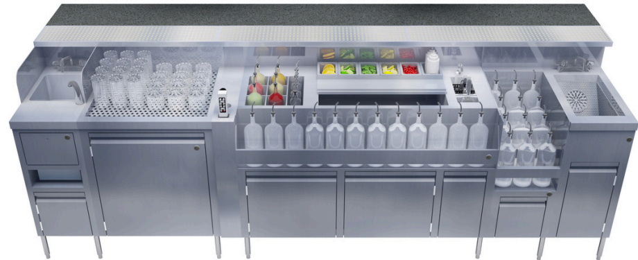
EuroBar | Sportivo ™