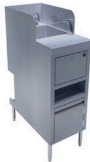
HAND SINK 12"