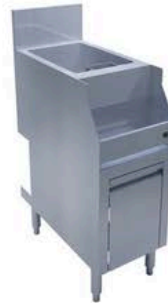
BOTTLE WELL 12", 15", 18", 24"