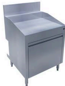
FREE SPACE 12", 15", 18", 24"