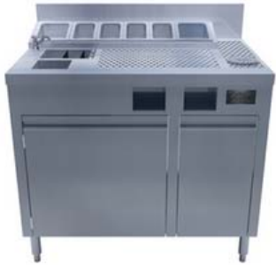
CLASSICO MAIN STATION