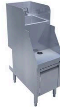
BLENDER STATION 12", 15", 18", 24"