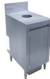
TRASH BIN 16"