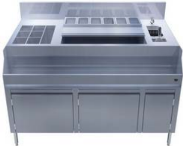
SPORTIVO MAIN STATION