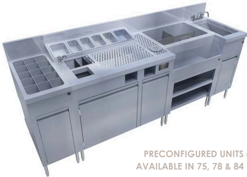
PRECONFIGURED UNITS (PCU) AVAILABLE IN 75, 78 & 84 INCHES