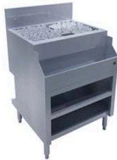
ICE BIN 12", 15", 18", 24"