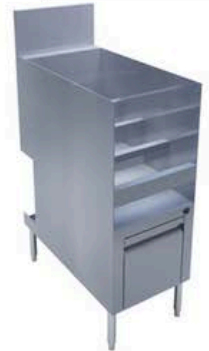
LIQUOR TREE 12", 15", 18", 24"