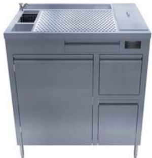
ALTO MAIN STATION