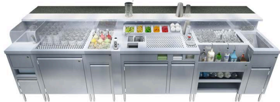
EuroBar | Classico ™