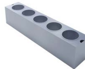
BOTTLE HOLDER FOR CONDIMENT TRAY