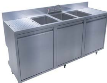
3-COMP SINK 19" & 24" DEEP