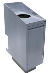
TRASH BIN 12"