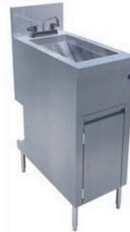
DUMP SINK 12"