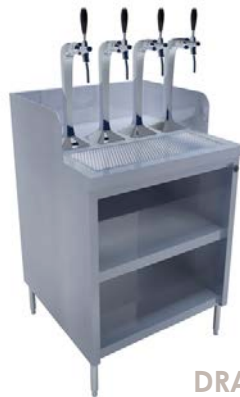
DRAFT TOWER UNIT 24"