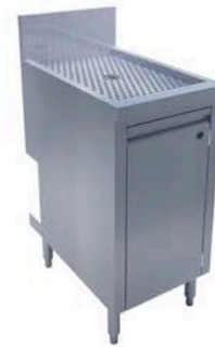
DRAIN BOARD 12", 15", 18", 24"